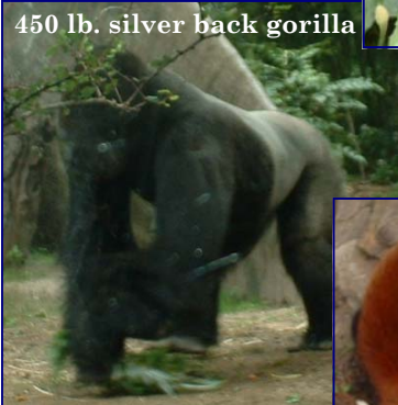
450 lb. silver back gorilla