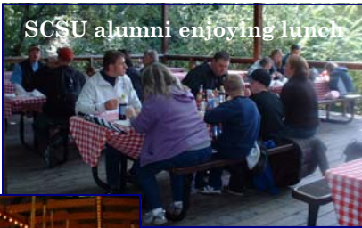
SCSU alumni enjoying lunch

Seventy-five Southern alumni and their friends and families gathered at the Bronx Zoo on a beautiful Saturday in October. Highlights of the visit included the African Congo, the Bug Carousel, the Butterfly House and lunch in the Dancing Crane Pavilion. There was so much to see and do at the zoo, it was difficult to fit it into one day, but our adventurous alumni braved the jungles and swamps for a look at some fascinating exhibits!