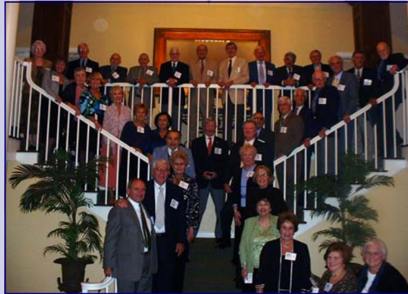
Class of 1958 at Woodwinds

The Class of 1958 gathered on October 3, 2008 at Woodwinds in Branford, CT for their 50th reunion where a cocktail party, dinner and reminiscing were enjoyed by all. Because the Class of 1958 graduated from New Haven State Teachers College, those who attended were given a new diploma reflecting the name Southern Connecticut State University.