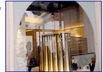
Dish Bar and Grille combines the contemporary with an urban feel!

Bring a handful of your business cards. Enjoy food and drinks in Dish's upscale, urban setting.