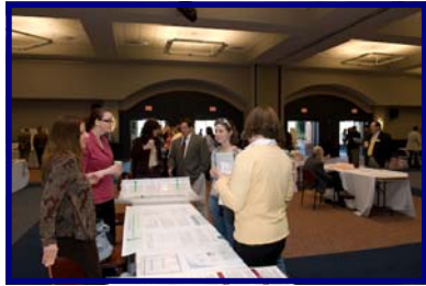
Showcase of Teaching, Learning and Creativity

Over 210 alumni and their families gathered on April 12th for the first school-wide reunion at Southern, A Celebration of the Arts & Sciences. The morning showcase featuring all 19 departments in the