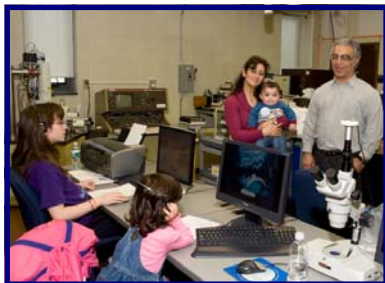
A visit to the Language Lab

We were fortunate to have 18 Southern authors join us for the "Meet the Southern Authors" section of the day. It was great to see all of them and how diverse their interests are.