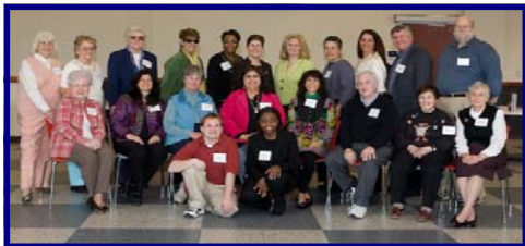
Meet the Southern Authors

School of Arts and Sciences was well attended by alumni and faculty and some very interesting research is going on in the departments.