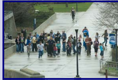
The Amazing Race Begins

Another popular event was The Amazing Race, where 68 alumni and their children had clues and ran throughout the campus finding more clues until they ended back outside the ballroom.