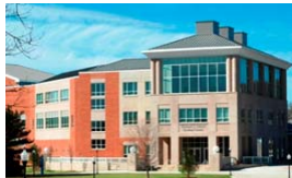
Michael J. Adanti Student Center