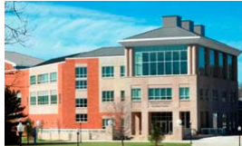
Michael J. Adanti Student Center