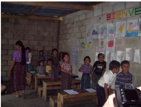
Children at the Escuela Privada David Lamotte in Tzanchaj Santiago Atitlan, Guatemala.