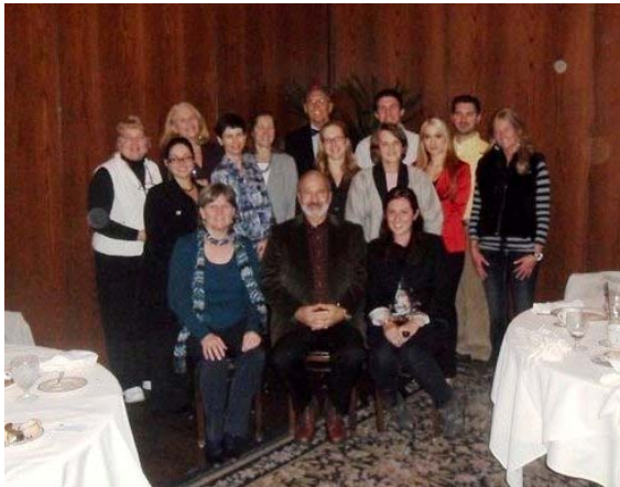
Students at the SCSU dinner